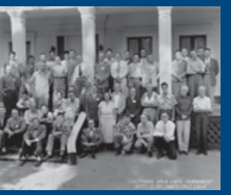
1951 California Open Chess Tournament Santa Cruz, California.