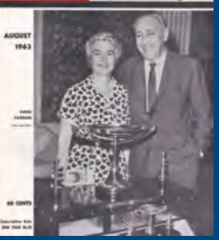
August 1963 Issue of Chess Review.