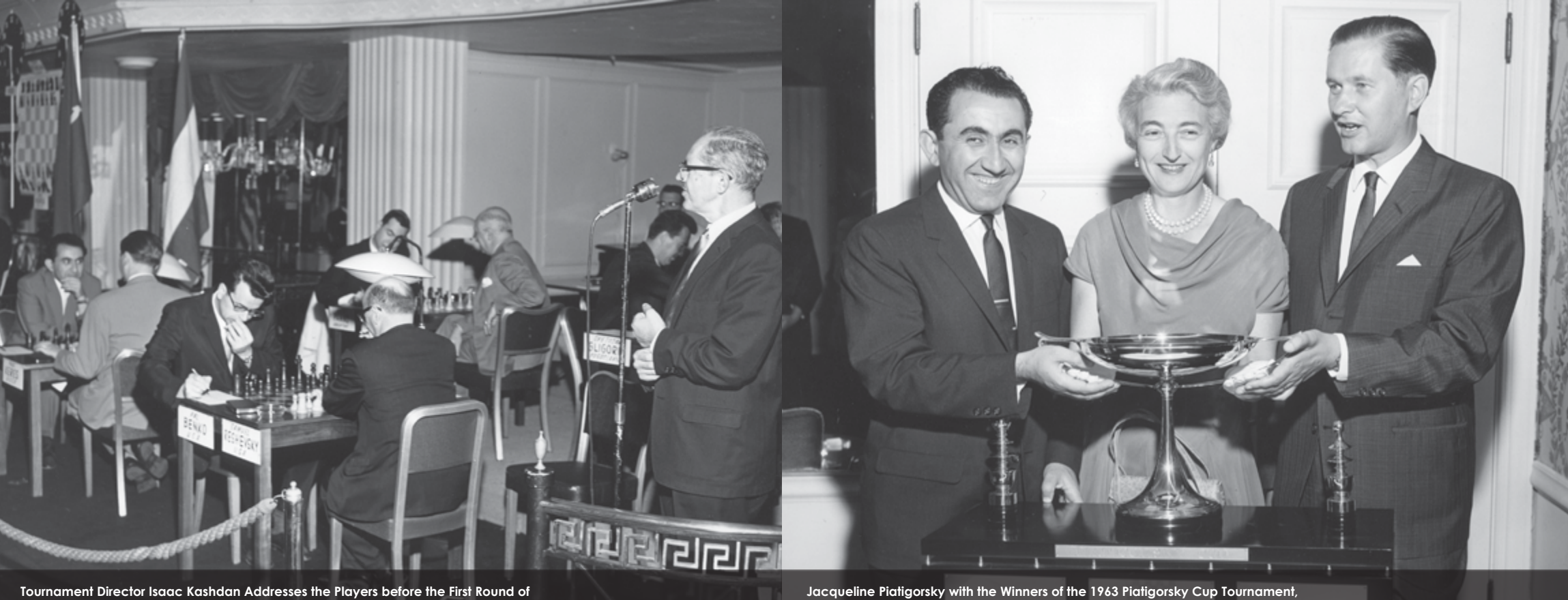
the 1963 Piatigorsky Cup.