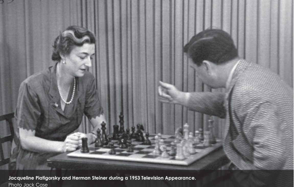
"...with a chess set, it is impossible to be bored."