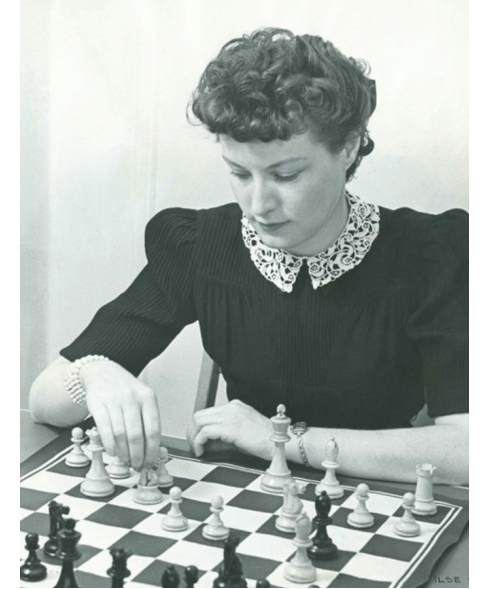
U.S. Women's Champion in the 1940s Mona May Karff appears in a new exhibition in Saint Louis devoted to women in chess.