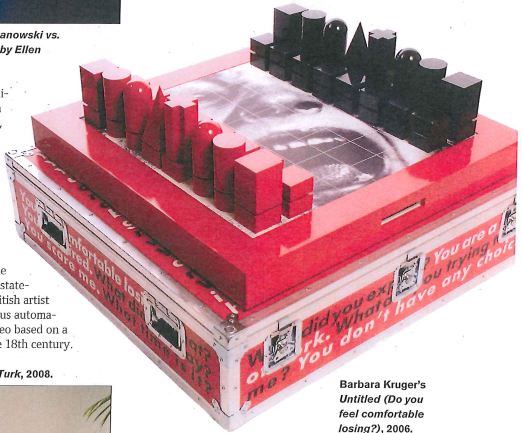
Barbara Kruger's Untitled (Do you feel comfortable losing?) , 2006.