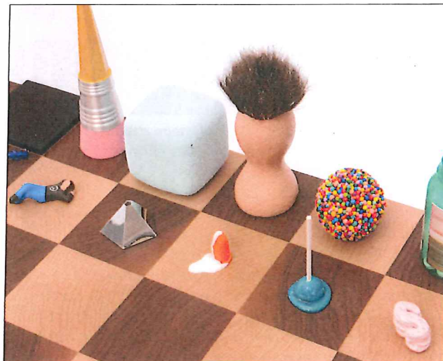
Untitled , 2005, by Tom Friedman.