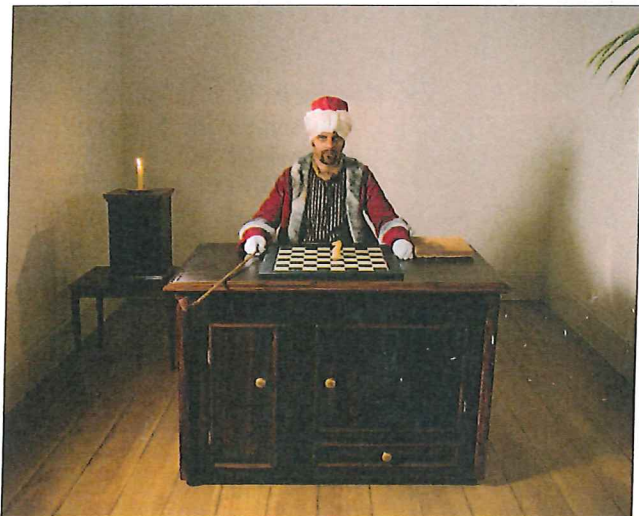
Still from Gavin Turk's The Mechanical Turk , 2008.

Guido van der Werve , from the Netherlands, weighed in with his expansive Number Twelve: Variations on a Theme (2009), encompassing film, photography, a musical soundtrack, and a "chess piano" fashioned by the artist.