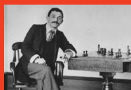
Emanuel Lasker, 1885

Fellow German Siegbert Tarrasch was expected to give Emanuel Lasker a tough time in their match held in Dusseldorf and Munich. However, Lasker won four of the first five games enroute to a 10 \frac{1}{2} –5 \frac{1}{2} victory. This match ended Tarrasch's title dreams.