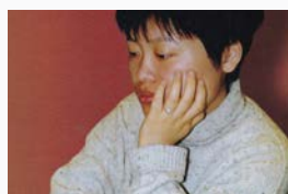
FIDE Forum, Vol. XIII, No. 4, 1999, Collection of FIDE

Capablanca was then undisputed world champion, and he attempted at the London 1922 international tournament to establish rules to govern future world championship matches. Those "London rules" signed by the top championship contenders, included a requirement that the champion could not refuse a challenge from a recognized con-