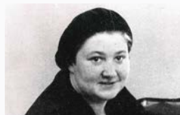
Vera Menchik, Date unknown

Vera Menchik faced her strongest rival, Sonja Graf of Germany, in a 16-game match in the Austrian resort town of Semmering. It was the second match privately organized between the players (Menchik won 3-1 in 1934) and the first recognized by FIDE. Menchik won easily 11 \frac{1}{2} -4 \frac{1}{2} .