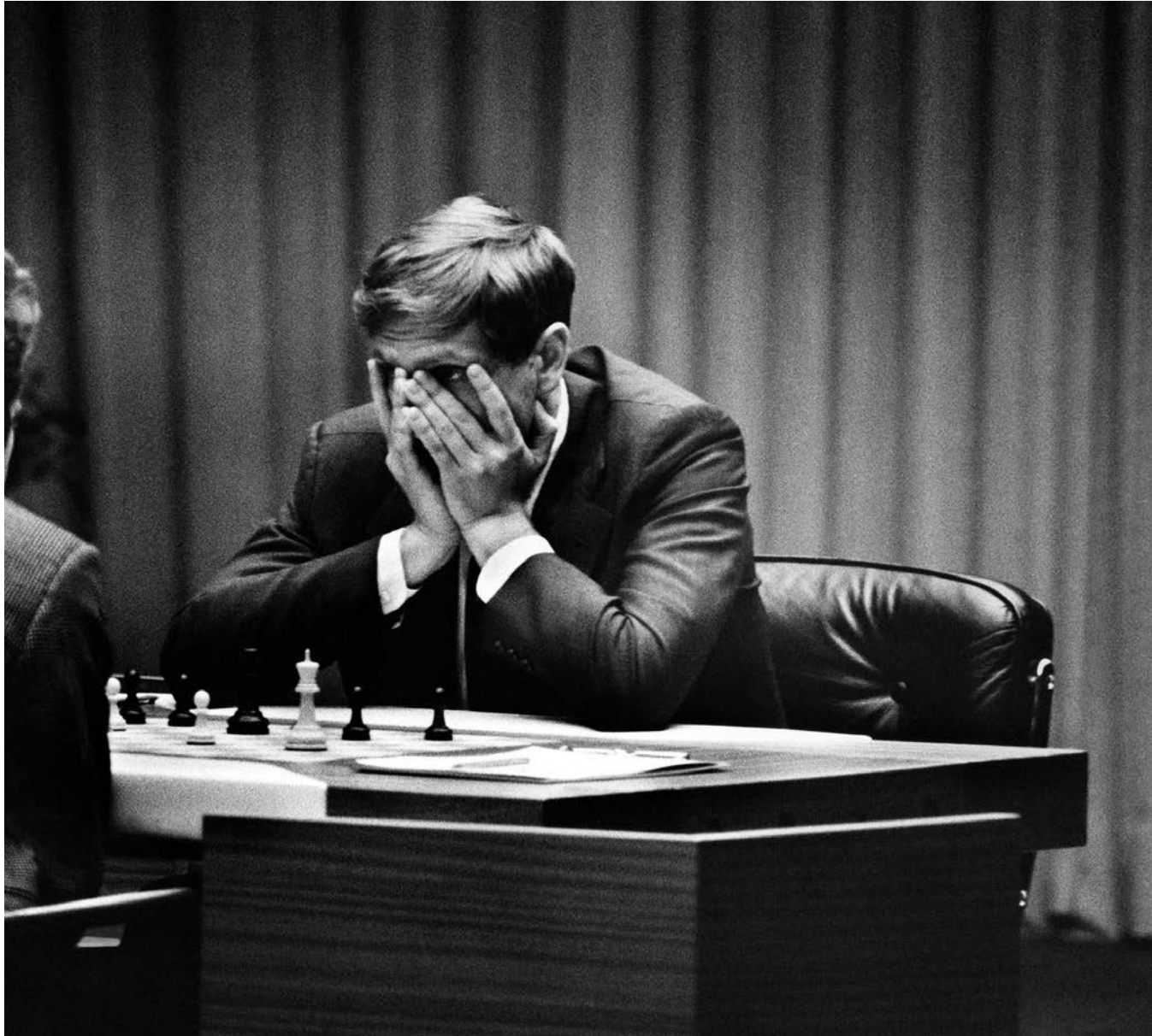
Fischer vs. Spassky, Game One, Iceland 1972

Merano, Italy, hosted the third Karpov-Korchnoi match. Karpov won 6–2 with 10 draws. Korchnoi, 50 when the match was played, was the oldest player to play in a World Championship match since Botvinnik in the 1960s.