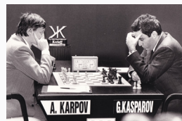
Anatoly Karpov vs. Garry Kasparov in the 1990 World Chess Championship, Lyon, France, 1990

The final Kasparov-Karpov match was divided between New York and Lyon. The prize fund of $3,000,000 (equal to $7,000,000 today) still holds the record as the largest ever. The players were tied after 17 games, but wins by Kasparov in games 18 and 20 decided the match.