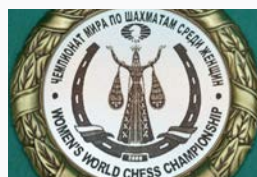
Maker unknown, Alexandra Kosteniuk's Medal from the 2008 Women's World Chess Championship, Nalchik, Russia, 2008. Collection of the World Chess Hall of Fame

Twenty-nine-year-old Xu Yuhua became China's third women's world champion when she defeated Alisa Galliamova in the finals of the 64-player knockout held in Yekaterinburg, Russia, by a score of 2\frac{1}{2}-\frac{1}{2} . Xu Yuhua stopped playing not long after ascending the throne, playing her last FIDE-rated game in 2011.