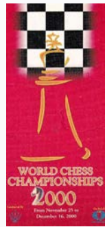
World Championship Program from the 2000 World Chess Championship, New Delhi, India, 2000

Vladimir Kramnik pulled off a major upset by defeating Garry Kasparov in the Brain Games (the successor to the PCA) World Championship held in London by a score of 8½–6½. So great was Kramnik's domination that Kasparov did not win a single game in the match.