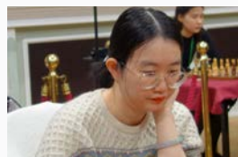
2017 Women's World Chess Champion Tan Zhongyi

Hou Yifan, who skipped the previous year's knockout championship, won her fourth title by defeating Mariya Muzychuk 6-3 in a match held in Lviv, Ukraine. This is the last time Hou, the second highest-rated woman ever at 2686 FIDE, has played in a Women's World Championship.