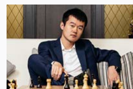
Stav Bonhage, Ding Liren, Winner of the 2023 World Chess Championship, 2023 , Collection of FIDE

Dubai hosted the World Championship match between Magnus Carlsen and Ian Nepomniachtchi. The match started with five draws, but then the champion won a 136-move game, the longest in World Championship history. This changed the momentum and Carlsen went on to win 7 \frac{1}{2} –3 \frac{1}{2} .