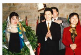
Susan Polgar Crowned Winner of the 1996 Women’s World Chess Championship, 1996, Collection of the World Chess Hall of Fame, gift of Susan Polgar

Nana Ioseliani tried to return the title to Georgia but was unsuccessful. Playing in her second title match in five years she lost to Xie Jun in Monaco by a score of 8 \frac{1}{2} –2 \frac{1}{2} . This was one of the most one-sided defeats in Women’s World Championship history.