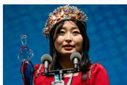
Ju Wenjun Receiving her Trophy for Winning the Women's World Chess Championship, 2023

Ju Wenjun won her third Women's World Championship by defeating Aleksandra Goryachkina of Russia in a match divided between Shanghai and Vladivostok. Once again, the event went to the tiebreak stage. This match was also the seventh in a row in which the champion and challenger were from either China, Russia, or Ukraine.