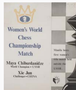
Artist unknown, Women's World Chess Championship Match, Manila, Philippines, 1991, Collection of the World Chess Hall of Fame

The 1990s also witnessed a new power in women's chess. While Chinese chess has a history lasting over one thousand years, China's involvement with the Western version of the game is much shorter. The country only joined FIDE in 1975, but no nation has been more successful in female chess in the past four decades.