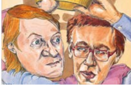
Chess Life, Vol. 51, No. 8, August 1996

The highwater mark of the PCA was the match between Garry Kasparov and Viswanathan Anand, which was held in New York at the World Trade Center. Anand led after nine games, but Kasparov took four of the next five to win 10½–7½.