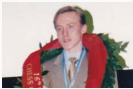
Photographer unknown, Ruslan Ponomarev, 2002 FIDE World Chess Champion, 2002 , Collection of FIDE