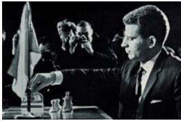
Boris Spassky as depicted in Soviet Life , February 1969. Published by the Embassy of the Union of Soviet Socialist Republics to the United States of America