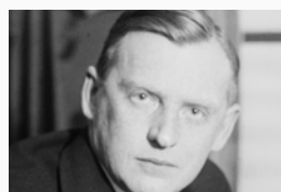
Alexander Alekhine, c. 1924.

Capablanca was the best qualified challenger, but Efim Bogoljubow fought the next two title matches with Alekhine. The first match, held throughout Germany and Holland, saw the champion emerge with a four-point lead after twelve games and coast to victory, 15\frac{1}{2} – 9\frac{1}{2} .