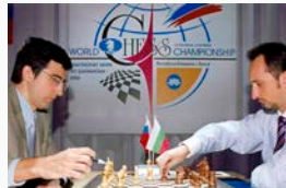
Mergen Bembinov, Vladimir Kramnik vs. Veselin Topalov Came One of the 2006 World Chess Championship , September 23, 2006

Veselin Topalov of Bulgaria became the new FIDE world champion with his victory in an 8-player double round robin held in Argentina. The 30-year-old Topalov scored a tremendous 10 out of 14 against the elite field which included Judit Polgar, the only women ever to compete in such an event.