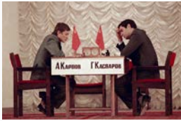
Anatoly Karpov Defending World Chess Champion, and Challenger Garry Kasparov during the World Chess Championship Finals, 1984.