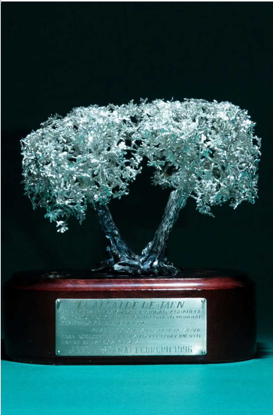
Left: Maker unknown, Susan Polgar's Trophy from the 1996 Jaén, Spain, Women's World Chess Championship, 1996, Collection of the World Chess Hall of Fame