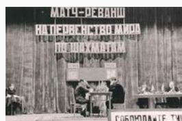
Vasily Smyslov vs. Mikhail Botvinnik, World Chess Championship Rematch, 1958.

Vasily Smyslov emerged as the seventh player to become world champion through his convincing defeat of Mikhail Botvinnik by a score of 12\frac{1}{2} – 9\frac{1}{2} . His reign as champion would be short as a clause in the regulations allowed the champion a rematch, a provision Botvinnik exercised.