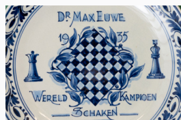
Maker unknown, Dr. Max Euwe World Chess Championship Commemorative Plate, 1935. Collection of the World Chess Hall of Fame.

The return match between Alekhine and Bogoljubow was a replay of their earlier encounter. Germany was again the venue and the champion repeated his quick start, up three points after twelve games. The final score was 15\frac{1}{2} – 10\frac{1}{2} .