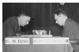
Max Euwe vs. Mikhail Botvinnik at the World Chess Championship, 1948.

The death of Alexander Alekhine on March 24 in Estoril, Portugal, left the crown vacant leaving FIDE, the governing body of chess, a chance to step in and formalize the rules and regulations of the World Championship. Henceforth the title would no longer be the private property of the world champion.