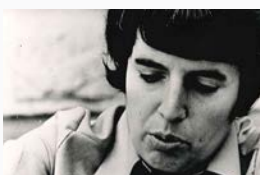
Camera Press LTD., Nona Caprindashvili 1975 , Collection of the World Chess Hall of Fame, PHOTOGRAPH BY TASS, CAMERA PRESS LONDON