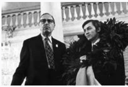
Anatoly Karpov Winner of the 1975 World Chess Championship, 1975.