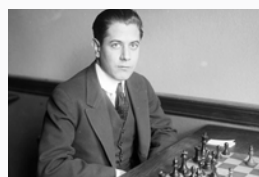
Harris B Ewing, José Raúl Capablanca, 1915, Collection of the Library of Congress

The French painter Leo Nardus once again sponsored Dawid Janowski for a shot at the crown, this time in Berlin. Lasker triumphed by a score of 9\frac{1}{2}-1\frac{1}{2} , the biggest margin of victory in a World Championship.