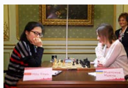
Seventh Game of the Women's World Chess Championship Match Between Mariya Muzychuk and Hou Yifan, March 11, 2016.

Ukraine gained a second women's world champion when Mariya Muzychuk defeated Natalia Pogonina of Russia 2\frac{1}{2}-1\frac{1}{2} to win the finals of a 64-player knockout tournament held in Sochi, Russia. In 2015, Ukraine issued a postage stamp honoring Mariya and her older sister Anna.