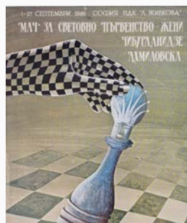
Maker unknown, XXIII Women's World Championship Match, Sofia, Bulgaria, 1986, Collection of the World Chess Hall of Fame