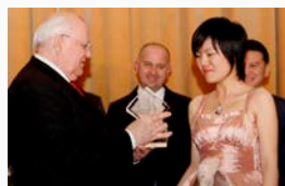
Hou Yifan Receiving Her Trophy at the 2011 World Women's World Chess Championship, Tirana, Albania, November 30, 2011.

Hou Yifan of China became the youngest Women's World Champion by defeating fellow countrywoman Ruan Lufei in the finals of the 64-player knockout held in Hatay, Turkey, in a match that went down to the tiebreaker. Hou, who broke Maya Chiburdanidze's record as the youngest champion, would win another three titles.