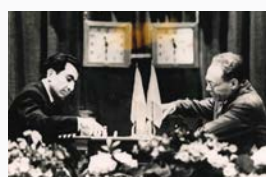
Mikhail Botvinnik and Tigran Petrosian at the World Chess Championship, Moscow, Russia, April 5, 1963.

Mikhail Botvinnik once again reclaimed his crown. Exercising the champion's right to a "revenge match" he defeated Mikhail Tal by a score of 13–8. Tal, who was hospitalized shortly before the event, lost games nine through eleven, effectively sealing his fate.