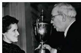
Elizaveta Bykova Winner of the Women's World Chess Championship Being Presented with the Trophy from V. Ragozin, March 3, 1958

Moscow was the location for a triangular title match between the reigning champion (Elizaveta Bykova), the former champion (Lyudmila Rudenko), and the challenger (Olga Rubtsova). The tournament of 16 games ended with the victory of Rubtsova who became the fourth women's world champion by finishing half a point ahead of Bykova.