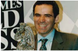
Garry Kasparov Winner of the 1993 Professional Chess Association Championship, 1993