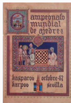
World Chess Championship, Seville, Spain, October 12-December 18, 1987

The most dramatic of the five Kasparov-Karpov World Championship matches was held in Seville, Spain. Kasparov trailed by a point with one game left meaning he had to win (the champion kept the title in case of a tie). He succeeded in one of the most memorable games in chess history.