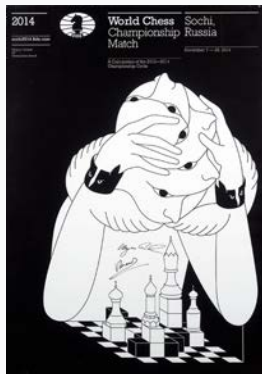
Pentagram for World Chess, World Chess Championship, Sochi, Russia , November 7-28, 2014, Collection of the World Chess Hall of Fame

Viswanathan Anand was removed from his throne by a new challenger. 22-year-old Magnus Carlsen of Norway became the second youngest player (behind only Garry Kasparov) to become the undisputed champion of the world when he defeated Anand in Chennai, India, by a score of 6 \frac{1}{2} –3 \frac{1}{2} .