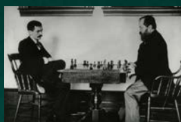
Emanuel Lasker v. William Steinitz, Philadelphia, 1894.

Steinitz again faced off against Chigorin in Havana in the fourth world championship. The American kept his title by a score of 12\frac{1}{2} – 10\frac{1}{2} , after the Russian blundered in the final game.