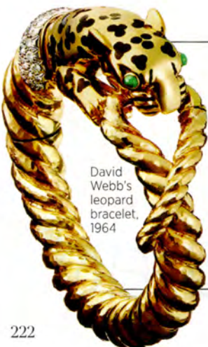
David Webb's leopard bracelet, 1964

MUST-SEE MOVIES Cameron Diaz and Penélope Cruz tangle with the law in Ridley Scott's thriller, The Counselor . And don't miss Kimberly Peirce's bloodcurdling adaptation of Stephen King's Carrie , starring Julianne Moore and Chloë Grace Moretz. ■