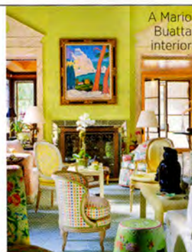
A Mario Buatta interior

Lions, leopards, and elephants dazzle on the pages of David Webb: The Quintessential American Jeweler . Meanwhile, Perry Ellis: An American Original celebrates a legacy of iconic sportswear. Interiors aficionados will relish Mario Buatta: Fifty Years of American Interior Decoration and Stephen Sills: Decoration ; and cinephiles will covet The Wes Anderson Collection .