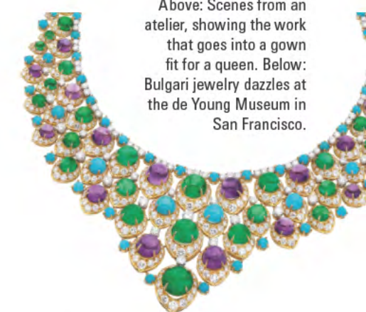
Above: Scenes from an atelier, showing the work that goes into a gown fit for a queen. Below: Bulgari jewelry dazzles at the de Young Museum in San Francisco.

display, including a dress emblazoned with an image of muse Isabella Blow. Memorable works from Gianfranco Ferré, Gucci, Viktor & Rolf, and more will also delight any fan of runway shows or fashion history.